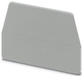
End cover, length: 61 mm, width: 2.2 mm, height: 41.5 mm, color: gray

Please be informed that the data shown in this PDF Document is generated from our Online Catalog. Please find the complete data in the user's documentation. Our General Terms of Use for Downloads are valid ( http://phoenixcontact.com/download )